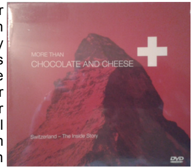
7 - More than Chocolate and Cheese chocolate-and-cheese.ch/english/

one new supporter after this furlough, a church that had previously supported us but has been through some rough times. Do pray for them and all of our supporters that God will continue to enable them to be a part of our team to reach the world for Christ.