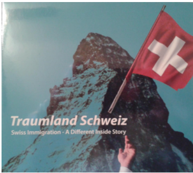
14 - Dreamland Switzerland en.traumlandschweiz.ch

the last several years. Both were on the air each week.