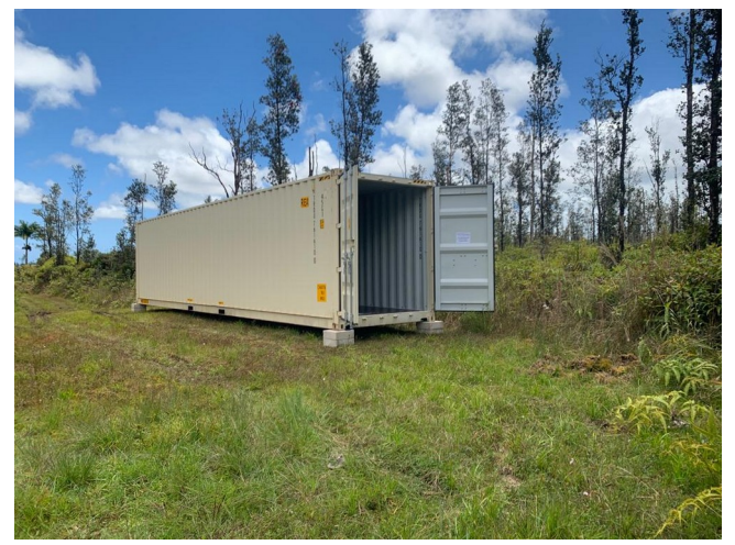
40' High Cube Shipping Container

Before we left we hired a man to come each month to care for the orchard and to do improvements. We are so thankful for having found someone so reliable and hard working. The property is flourishing under his care.