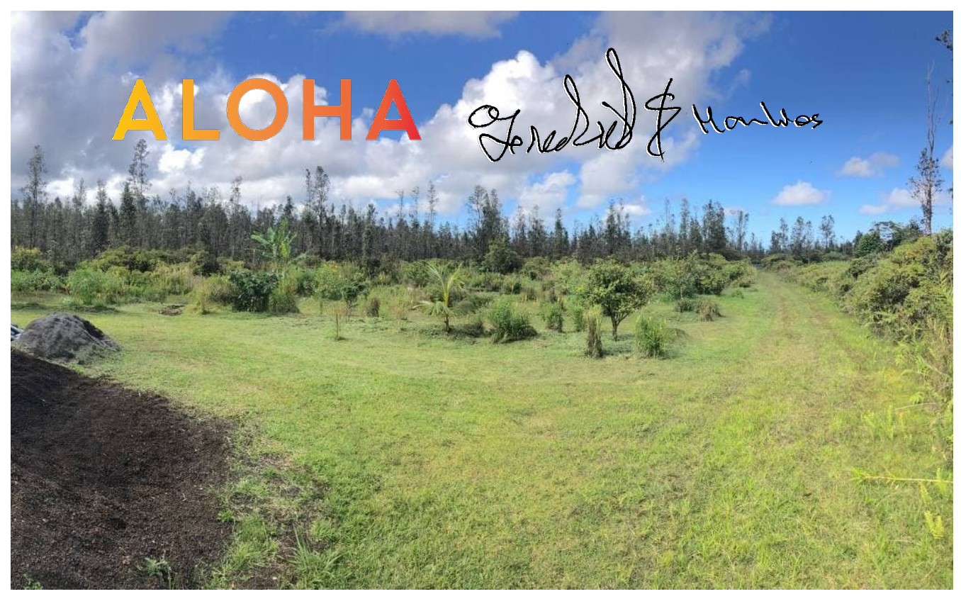
Orchard in April 2021 with the native <u>'ōhi'a trees</u> in the background. The coconut palm has grown. The piles to the left are black cinder and dirt used in the orchard. The driveway to the street is on the right.