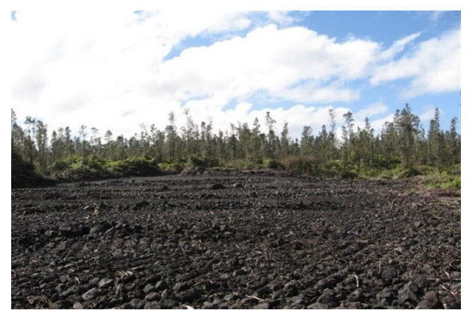
Orchard area after the previous owner had it ripped with a bulldozer in 2007

bulldozer drug its giant hook through the lava flow mounds to break them up and then used its own weight to crush and pack them making a leveler surface. They also planted around 20 fruit trees and a Macadamia nut tree on the property. However when we viewed the property the grass (light green in the photo) had grown so tall that we could not see many of the trees.