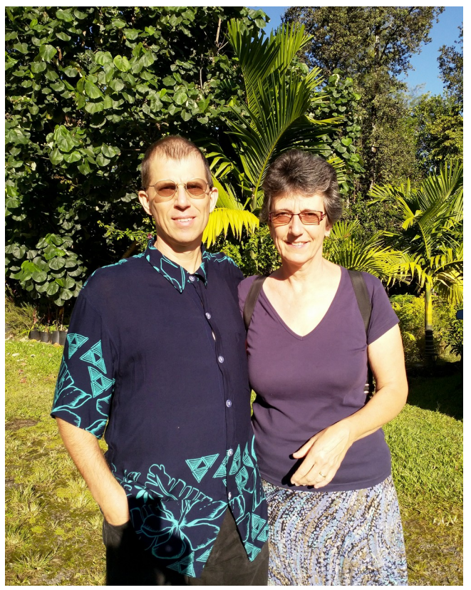
Sunday Morning in Hawai'i before church

We currently do not have an exact date that we will leave Switzerland, as Marlies' US immigration visa application is still in progress. We submitted the first papers in September 2020. Currently we are waiting on the National Visa Center (NVC) to determine that the submissions of my Affidavit of Support and