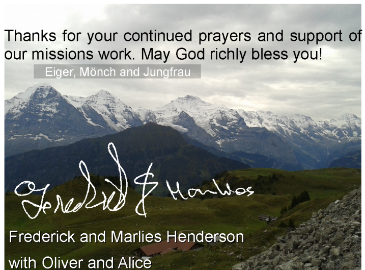
Eiger, Mönch and Jungfrau

Thanks for your continued prayers and support of our missions work. May God richly bless you!