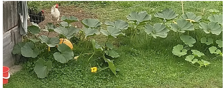
Volunteer pumpkins by the chicken coop