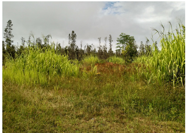
Our orchard as we first saw it in 2019. Can you find the small coconut palm in the grass? (it is in the center of the photo)

As you might guess this decision is not one that was made overnight and has been years in the making. During our two month trip to Hawai'i in October and November of 2019 we saw God's confirmation over and over again, through the friends we made and brought together, the home church we found, and even through the piece of land that we purchased. We saw a listing for it shortly after it went on the market on June 19, 2019. We thought that it was a very nice property, especially for the asking price.