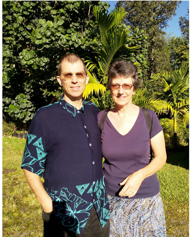
Sunday Morning in Hawai'i before church

We currently do not have an exact date that we will leave Switzerland, as Marlies' US immigration visa application is still in progress. We submitted the first papers in September 2020. Currently we are waiting on the National Visa Center (NVC) to determine that the submissions of my Affidavit of Support and