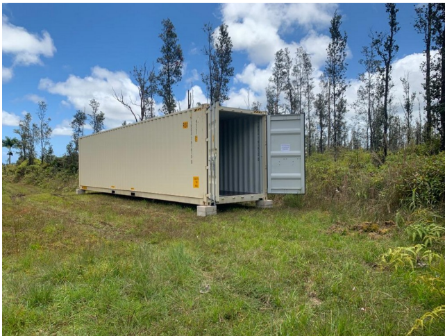
40' High Cube Shipping Container

Before we left we hired a man to come each month to care for the orchard and to do improvements. We are so thankful for having found someone so reliable and hard working. The property is flourishing under his care.