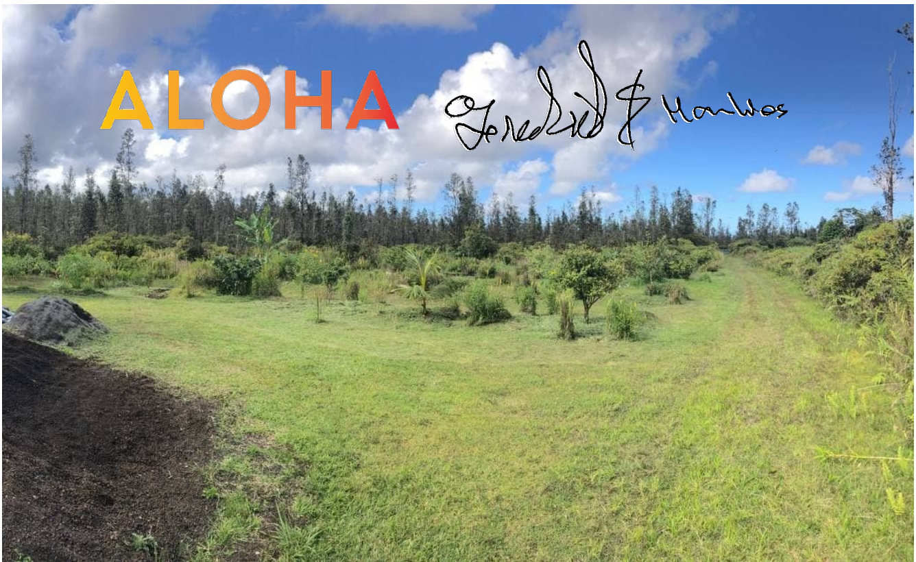
Orchard in April 2021 with the native 'ōhi'a trees in the background. The coconut palm has grown. The piles to the left are black cinder and dirt used in the orchard. The driveway to the street is on the right.