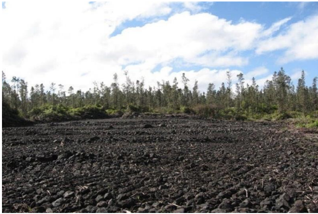
Orchard area after the previous owner had it ripped with a bulldozer in 2007

bulldozer dug its giant hook through the lava flow mounds to break them up and then used its own weight to crush and pack them making a leveler surface. They also planted around 20 fruit trees and a Macadamia nut tree on the property. However when we viewed the property the grass (light green in the photo) had grown so tall that we could not see many of the trees.